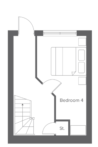
Lower ground floor